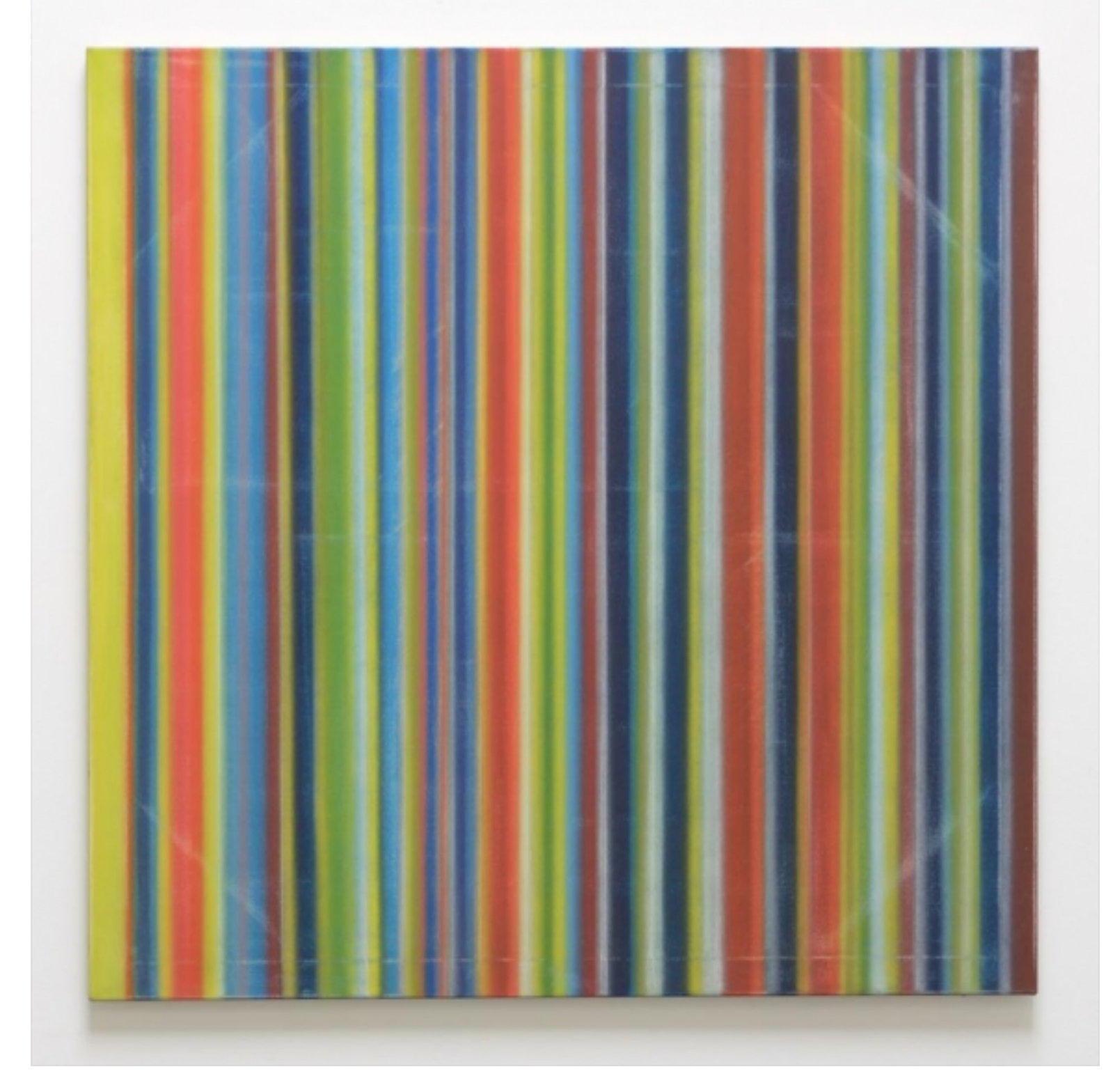
El Pinche, 2015 / Synthetic polymer on canvas / 48 \times 48 inches

SELECTED WORKS INSTALLATION VIEWS THUMBNAILS BACK